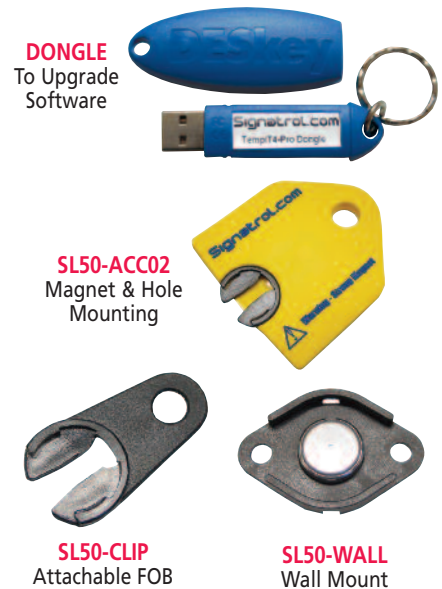
DONGLE To Upgrade Software